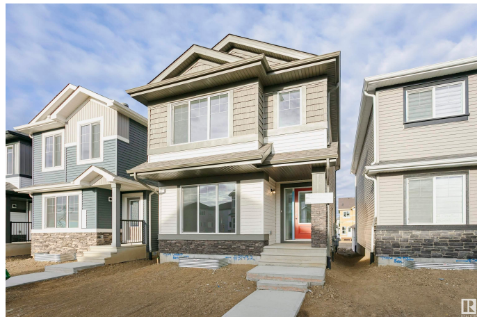
9564 Carson Bend SW, Edmonton, AB

Main Floor Exterior Area 74.83 m 2 Interior Area 68.68 m 2