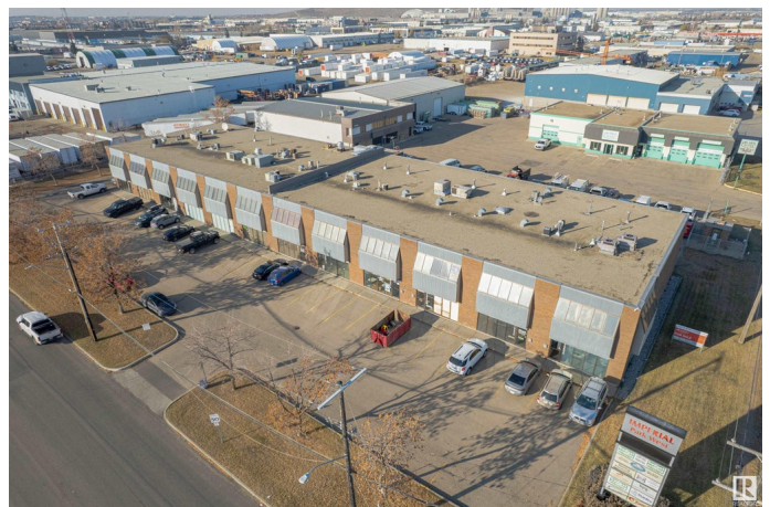
15612 116 Ave NW, Edmonton, AB

Main Floor Exterior Area 1585.08 sq ft Interior Area 1569.02 sq ft